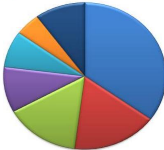
Market share in the UK supermarket industry

Check your answer, Supermarkets. https://drive.google.com/open?id=1ebzCf6_2Uu7rNbUmBAJ-ayEWMYhHy-Rv